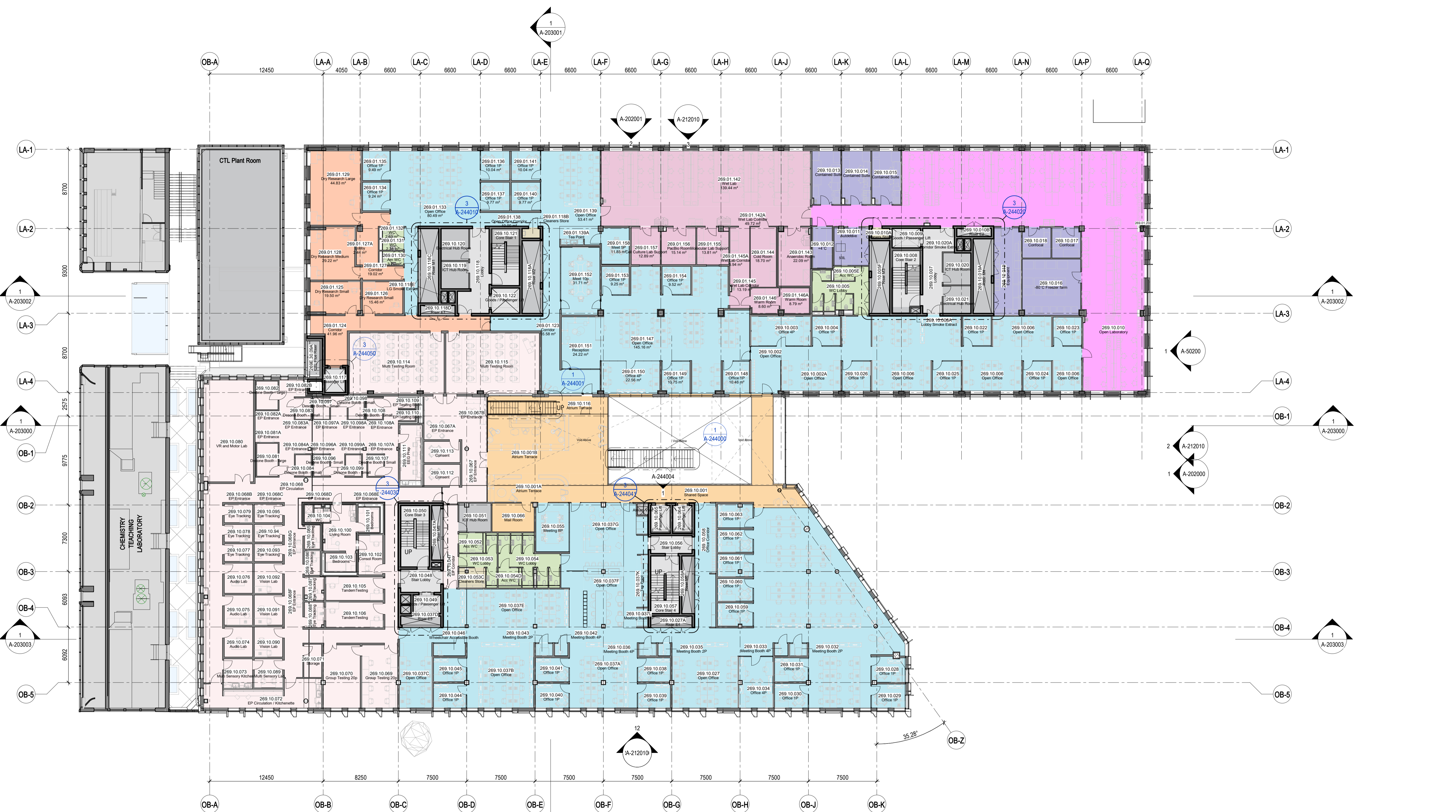
1 FIRST FLOOR PLAN 1: 200