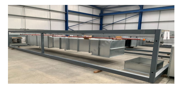
Fig 1.2 Plant Room elements in Production.